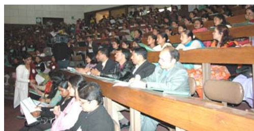
Participants of the First National Consultation on WHRDs