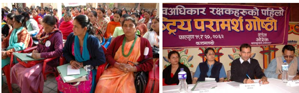
Participants of the First National Consultation on WHRDs