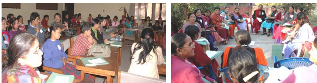
Participants of the First National Consultation on WHRDs

It has the power to hold individuals responsible for criminal acts in a court of law. Gender based persecutions are explicitly recognised as crimes. However, for ICC to be effective the state needs to have ratified the Statute. In case of Nepal, the state has not ratified it, in which case, it is not applicable to us till we ratify it.