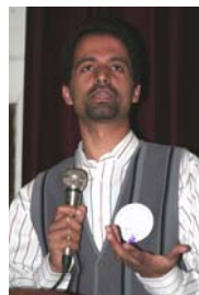
Sunil Babu Pant