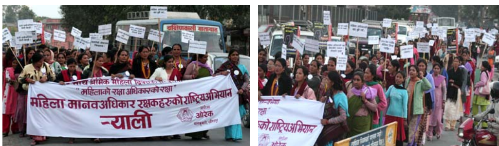
Women Human Rights Defenders Rally on March 3, 2006